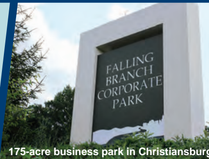
175-acre business park in Christiansburg

The Roanoke Regional Airport (ROA) offers more than 50 scheduled flights daily, with nonstop service out of our region to nine major cities. Other notable airports within a reasonable drive include: Charlotte Douglas International Airport (2.5 hrs); Washington Dulles International Airport (4 hrs) and Piedmont Triad International Airport (2 hrs).