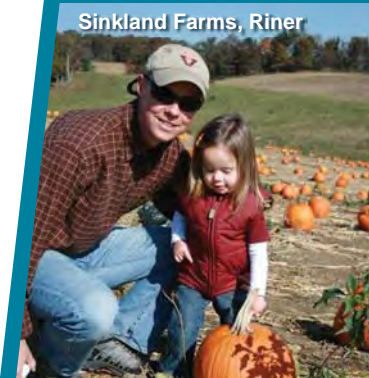
Sinkland Farms, Riner