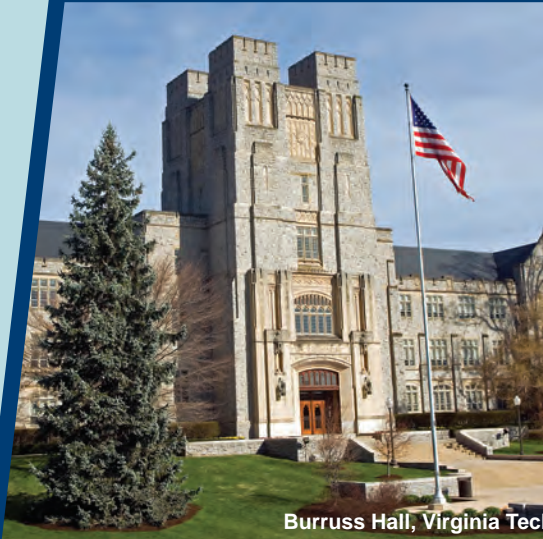
Burruss Hall, Virginia Tech