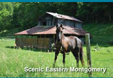
Scenic Eastern Montgomery