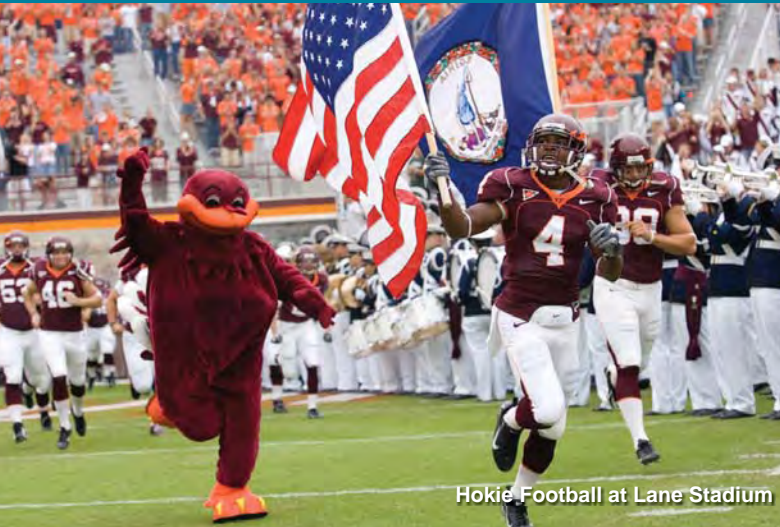
Hokie Football at Lane Stadium