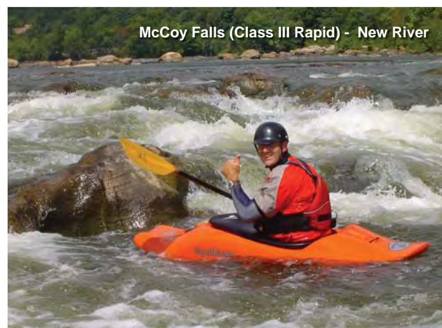
McCoy Falls (Class III Rapid) - New River