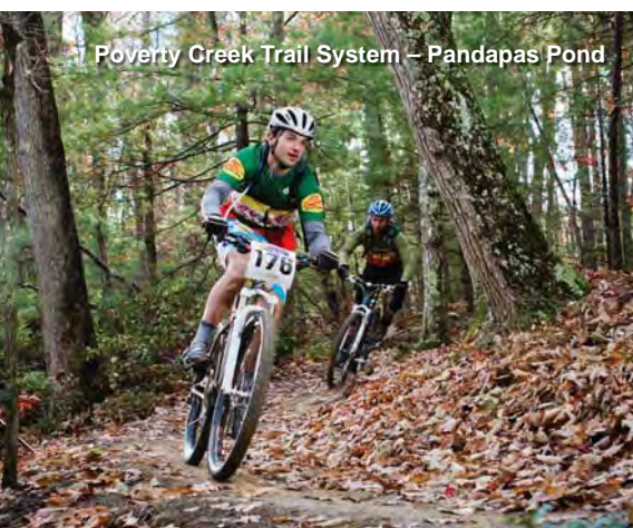
Poverty Creek Trail System – Pandapas Pond

McAfee Knob (pictured) is a popular local hiking destination along the Appalachian Trail – a 2,178-mile trail from Georgia to Maine that traverses through the New River and Roanoke Valleys. The McAfee Knob day hike offers a steady climb up some 1,200 feet in 3.5 miles. The Knob sits at an elevation of 3,200 feet and provides a breathtaking 270-degree view of the mountains and valleys below.