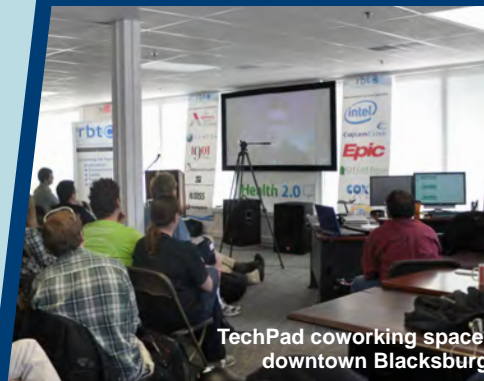
TechPad coworking space, downtown Blacksburg