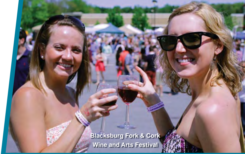
Blacksburg Fork & Cork Wine and Arts Festival

Montgomery County is located in an 11-county/city region known as the New River and Roanoke Valleys – two adjacent metro areas with a combined population of almost half a million. Montgomery County is the second largest jurisdiction in the region and is the economic hub of the New River Valley.