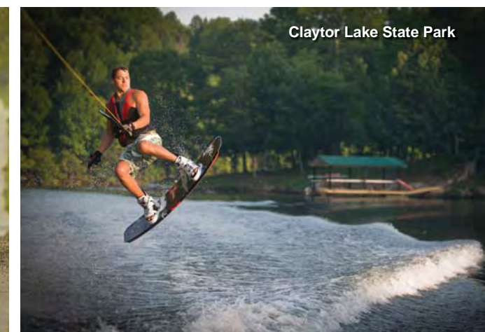
Claytor Lake State Park