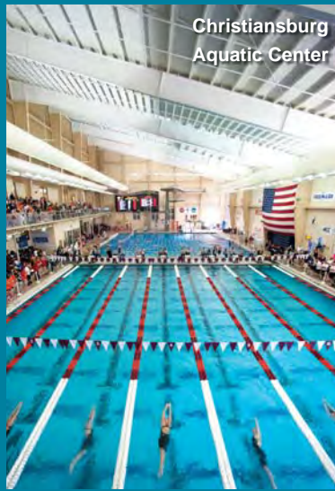
Christiansburg Aquatic Center