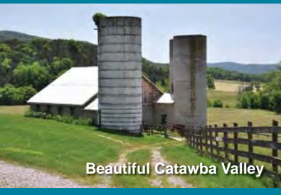
Beautiful Catawba Valley