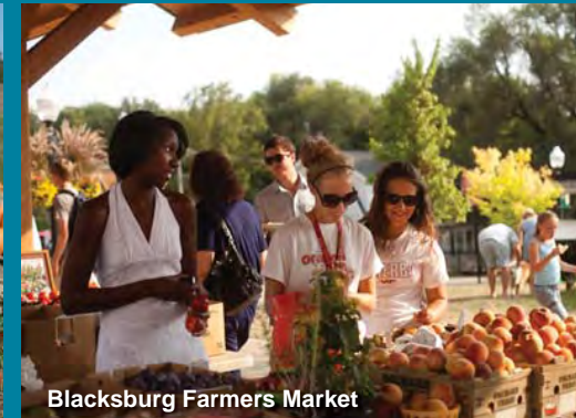
Blacksburg Farmers Market