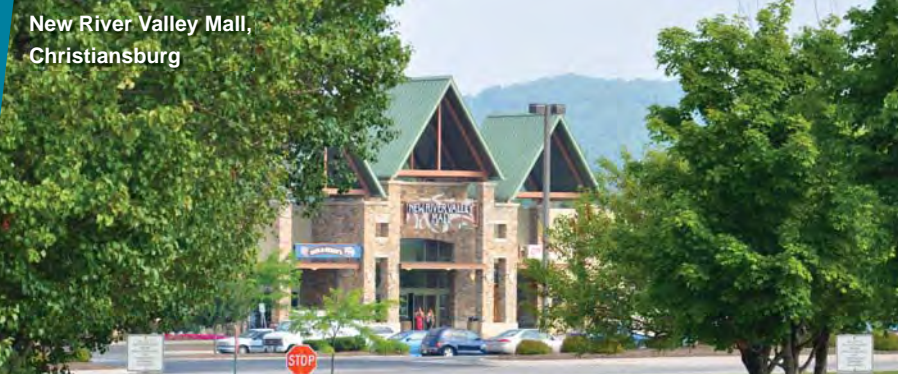
New River Valley Mall, Christiansburg