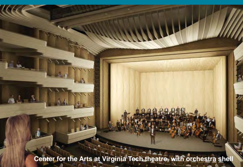
Center for the Arts at Virginia Tech theatre, with orchestra shell

Montgomery County, Virginia is a progressive, technology-driven community with an abundance of outdoor amenities. Our small-town charm, natural beauty and urban appeal make us an attractive place for families, young professionals, and active retirees.